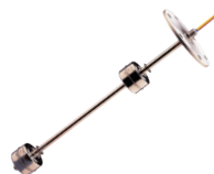
LS-700 Float Type Level Sensor