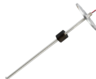
XM-700 Float Type Level Transmitter