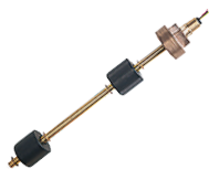
LS-800 Float Type Level Sensor

Visit GemsSensors.com to view our full range of liquid level sensing products